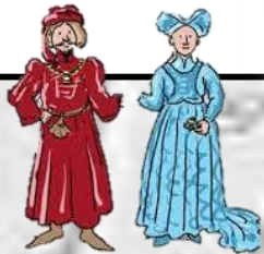
Kings and Queens