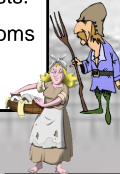
Servants and Peasants